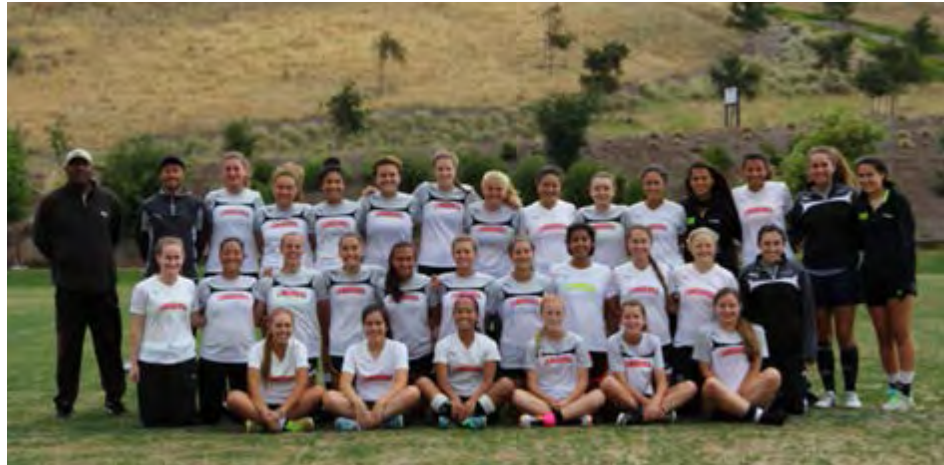
The Lamorinda Soccer Club was chosen as a Development Academy.

U.S. Soccer chose the Lamorinda Soccer Club as one of the first 25 Girls Development Academies in the nation. Lamorinda is one of only three clubs in Northern California to achieve this elite status. In selecting the small Lamorinda club for this honor, U.S. Soccer looked at the quality and license levels of the coaching staff, the number of players the club sent to high level college teams, the U.S. Women's National Teams and professional leagues, as well as other factors.